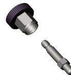
SCBA Adapter (American Standard) Part #: 9111-S

Below are the adapters available with the Filler Hose Assembly. Please select from the following choices: