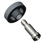
SCBA-DIN Adapter (European Standard) Part #: 9131-S